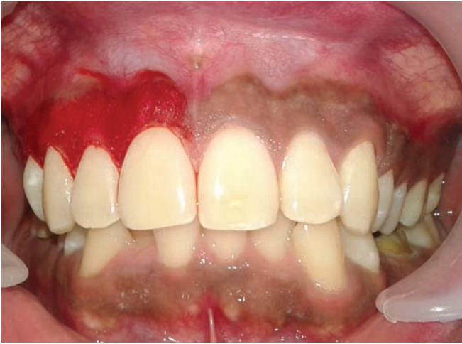
Fig. 2: Removal of pigment layer