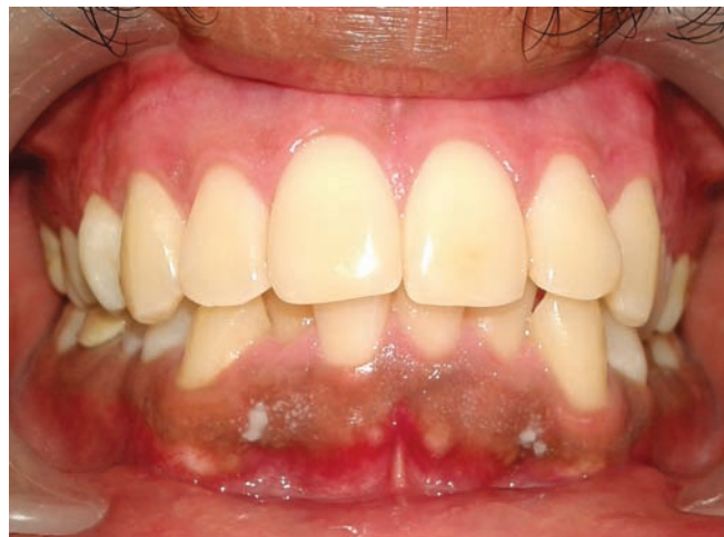
Fig. 8: One week postoperative healing