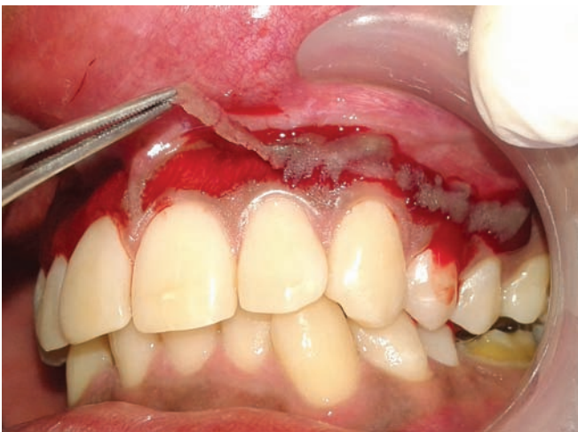
Fig. 4: Continuous band of split thickness flap