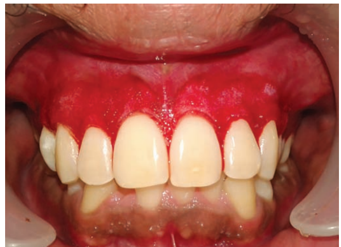
Fig. 6: Removal of pigment layer—deepithelialization

Patient's acceptance of the procedure was good. Healing process was uneventful with no postoperative pain, hemorrhage, and infection. No scarring was observed,