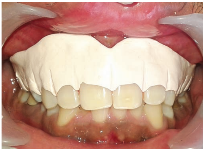
Fig. 7: Periodontal dressing