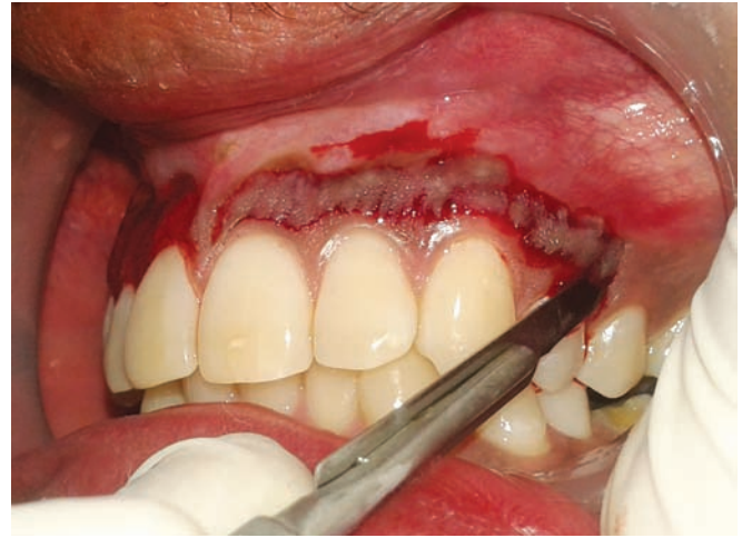
Fig. 3: Split thickness flap using scalpel