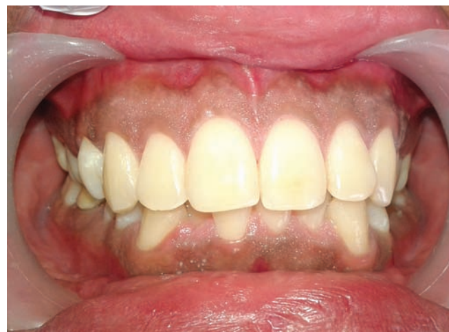
Fig. 1: Gingival melanin pigmentation (preoperative)

A 23-year-old male patient visited the Department of Periodontics and Oral Implantology, Sri Hasanamba Dental College & Hospital, Hassan, Karnataka, India, with the chief complaint of blackish gums (Fig. 1). Oral examination revealed pronounced bilateral melanin-pigmented gingiva in maxillary and mandibular regions. The patient requested for esthetically better gums; hence, considering the patient's concern, a surgical gingival deepithelialization procedure using the gold standard scalpel deepithelialization technique was planned. The entire procedure was explained to the patient and written consent was obtained. To rule out any contraindication for surgery, a complete medical examination, family history, and blood investigations were done. Oral prophylaxis was done before the surgery.