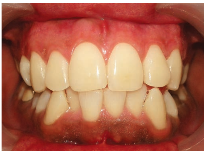
Fig. 9: Four months postoperative follow-up