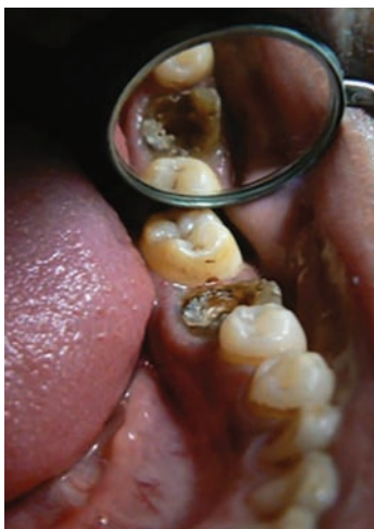
Fig. 4: Post space preparation