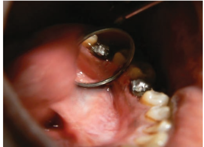
Fig. 3: Crown lengthening