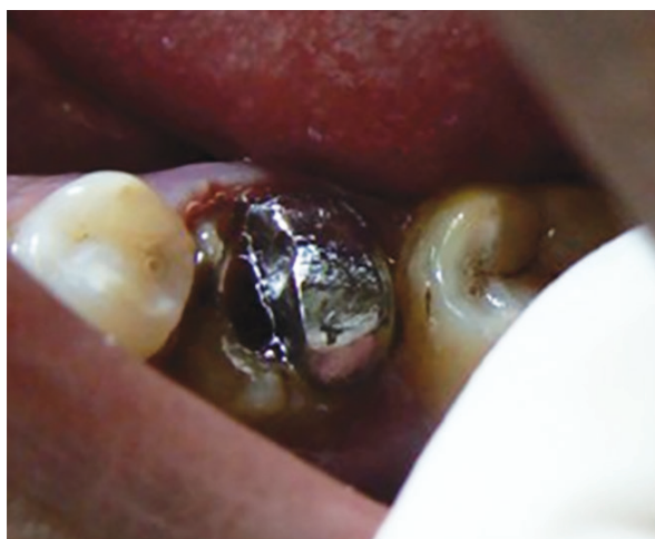
Fig. 7: Placement of distal post