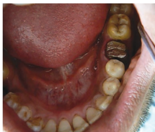
Fig. 10: Intraoral postoperative

cast metal post over fiber-reinforced composite posts have a favorable failure mode when compared with metallic posts. Various post system and post and core technique have been implemented in dentistry. The selected post and core technique must be conventional, morphologic, selective, and esthetic, and resist radicular fracture. 7