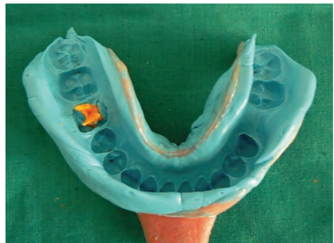
Fig. 5: Intracanal impression