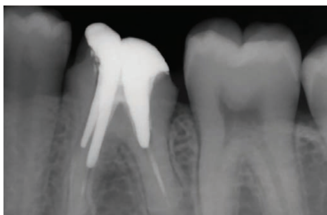
Fig. 9: Postoperative radiograph