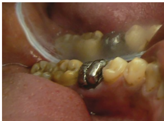
Fig. 8: Placement of mesial post