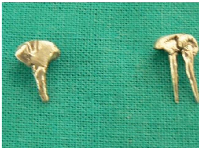
Fig. 6: Split post