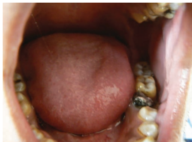
Fig. 1: Intraoral preoperative

1 Assistant Professor, 2 Private Practitioner, 3-5 Senior Lecturer 6 Professor