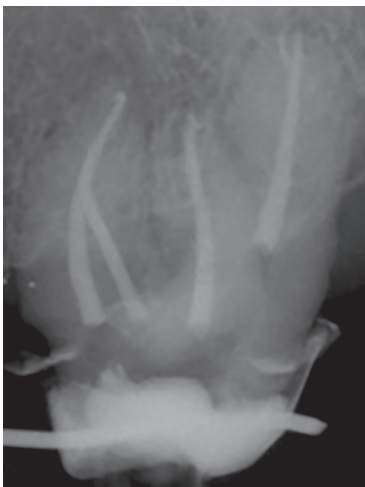
Fig. 3: Post-operative radiograph

The lengths of the canals were determined by a Root-ZX II apex locator (Morita, Tokyo, Japan) and were confirmed with a periapical radiograph of different angulation with a 15° cone shift to confirm canal configuration (Fig. 3). The canals were prepared with Protaper file system using the crown-down technique. During root canal preparation, irrigation was performed using a normal saline solution, 2.5% sodium hypochlorite solution, and 17% ethylenediaminetetraacetic acid. The canals were dried with absorbent paper points (Dentsply Maillefer, Ballaigues, Switzerland), and obturated using cold lateral compaction of gutta-percha points (Dentsply Maillefer, Ballaigues, Switzerland) and AH26® resin sealer (Dentsply Maillefer, Ballaigues, Switzerland). Postoperative radiography was used to evaluate the obturation quality (Fig. 3), followed by postendodontic restoration.