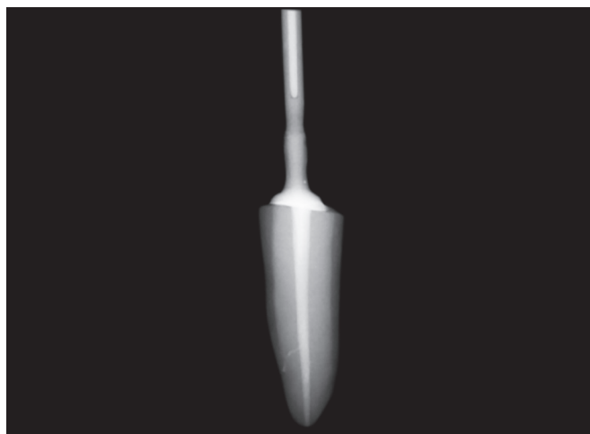
Fig. 1: Radiograph of sample obturated with Thermafil

The teeth obturated with thermafil and calamus showed least leakage as compared to the other groups. The mean values were statistically significant when compared with other groups.