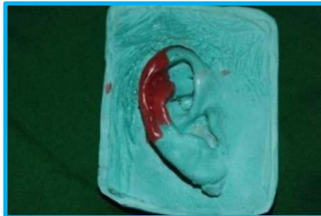
Fig. 4: Wax-up on cast