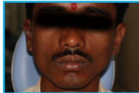
Fig. 7: Final prosthesis

five; and was lost in an accident. The hearing was normal. Patient was physically challenged, due to polio affected lower limbs, and a limping gait. He was exacting but cooperative. Patient was photographed for reference and records [Fig. 1]. The following restorative options were considered- Surgical Autogenous Reconstruction, Implant retained auricular prosthesis, Silicone prosthesis retained with magnets or Silicone prosthesis retained with soft tissue undercuts and