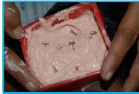
Fig. 2a: Impression making