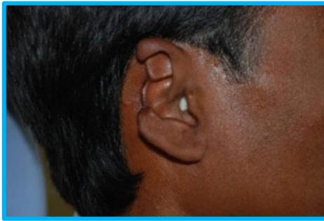
Fig. 1: Ear defect