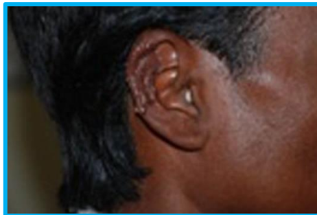
Fig. 6: Final prosthesis