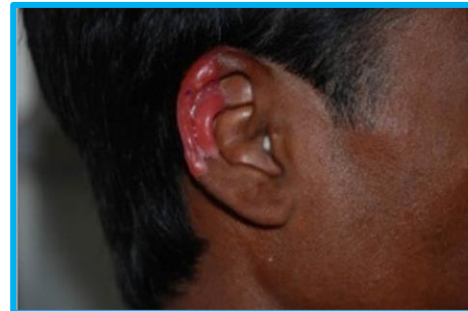
Fig. 5: Wax trail