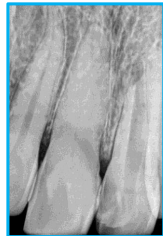
Fig. 6: Pre-op IOPA showing Pulp canal obliteration with 11#