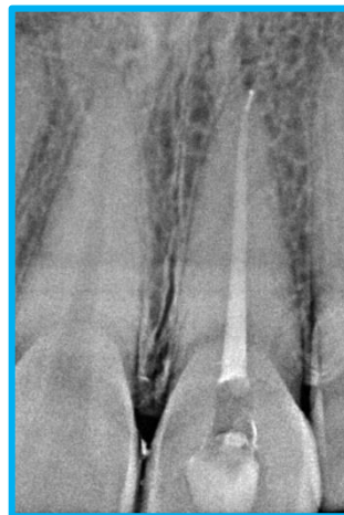
Fig. 5: Obturation followed by GIC restoration