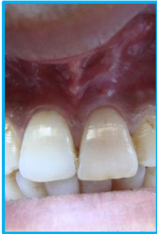
Fig. 1: Discoloration and Intra-oral sinus with 21#