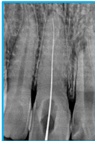
Fig. 7: Working length determination with No 10 K file