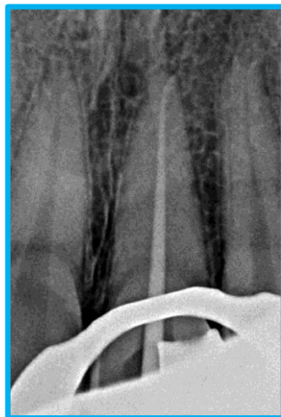
Fig. 4: Master Gutta Percha cone (F2 Protaper; Dentsply)