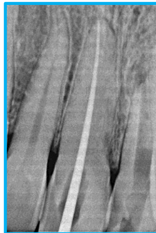
Fig. 8: Master Gutta Percha cone (F2 Protaper; Dentsply)