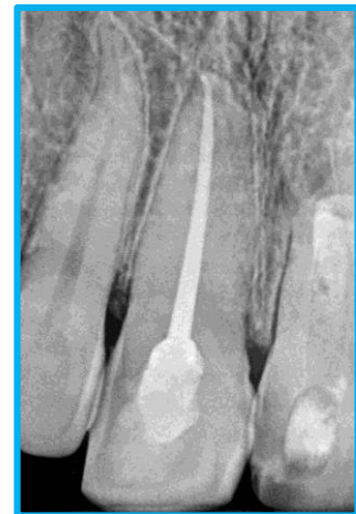
Fig. 9: Obturation followed by GIC restoration

inspection of the file was done to identify any sign of fatigue, irregularity of the flutes or any other defects. #8 C+ file was then used in filling motion along with copious irrigation. When the