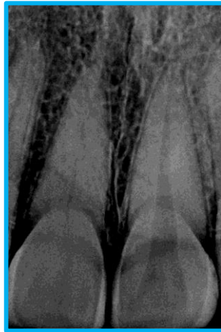
Fig. 2: Pulp canal obliteration with 21#