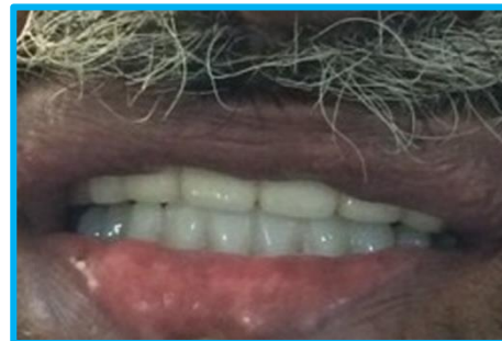
Fig. 4: Post-operative photograph of the patient

prefabricated gingival formers to allow formation of soft tissue cuff. The time period between the surgical phases was used to finish the root canal therapy for all the remaining upper teeth and fabrication of fixed prosthesis.