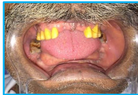
Fig. 2: Pre-operative photograph of the patient