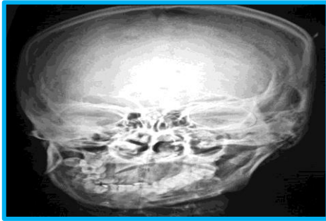
Fig. 1: Pre -op PA x-ray