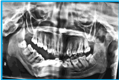
Fig. 3: Pre-op OPG