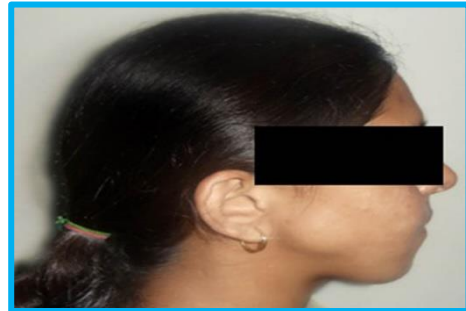
Fig. 4: Pre-op lateral view