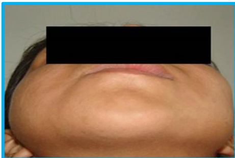
Fig. 7: Post-op worm's view

examination revealed a flat labiomental fold with competent lip. Hence, a sloping facial profile that worsens the lack of chin projection. The mandibular midline was 5 mm to the left of the facial midline and the occlusal plane was not canted. The PA X-ray and Lateral X-ray was taken for defining the site and amount of deficiency tracings on lateral cephalogram were subjected for both hard and soft tissue, the amount needed for advancement 10 mm