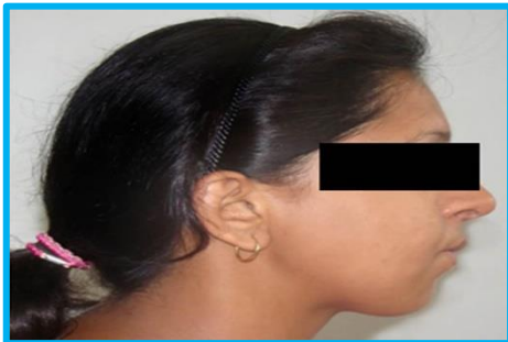
Fig. 5: Post -op lateral view