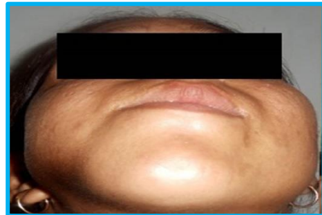
Fig. 6: Pre-op worm's view