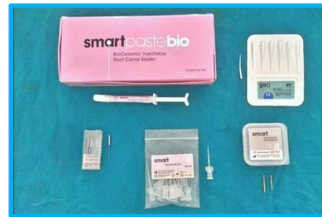
Fig. 1: Materials used for obturation