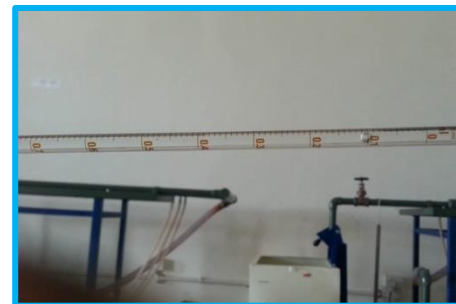
Fig. A3: At 0 min time interval