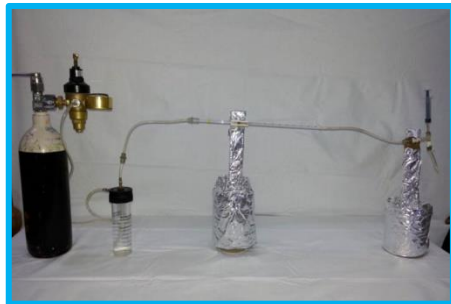
Fig. 2: Fluid filtration system