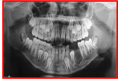
Fig. 2: One year post-operative panoramic radiograph showing the healed surgical defect following enucleation of the lesion and extraction of 74, 75 and 35

The tooth bud of 45 is completely enclosed within the lesion and is also displaced distally