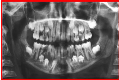
Fig. 3: Panoramic radiograph shows dental caries involving the pulp in 85 and well defined periapical radiolucency in the region of 84 and 85 involving the furcation areas of the teeth.

There is resorption of the roots of 85 and distal displacement of the tooth bud of 44